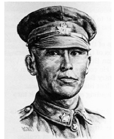
A Peaceful Man, Francis Pegahmagabow

Pegahmagabow would earn his second bar to the MM during the final months of the First World War in the Battle of the Scarpe (part of the 2nd Battle of Arras). The commendation reads: